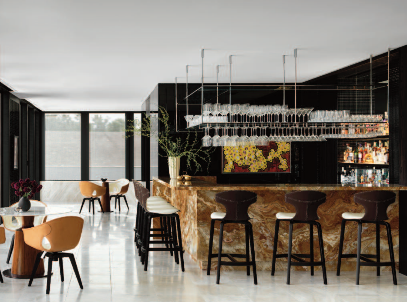
Above: the ‘crown, a glass and steel box set atop the main entry portal into the house, contains a large entertainment lounge with a full-service bar. Below left: one of the guestrooms with millwork walls with upholstered inserts, custom-embedded storage drawers in the beds to maximize space. Beside that: the primary bedroom with a hand-painted Fromental wall covering and custom designed wall-to-wall carpeting completing the suite’s luxurious embrace.