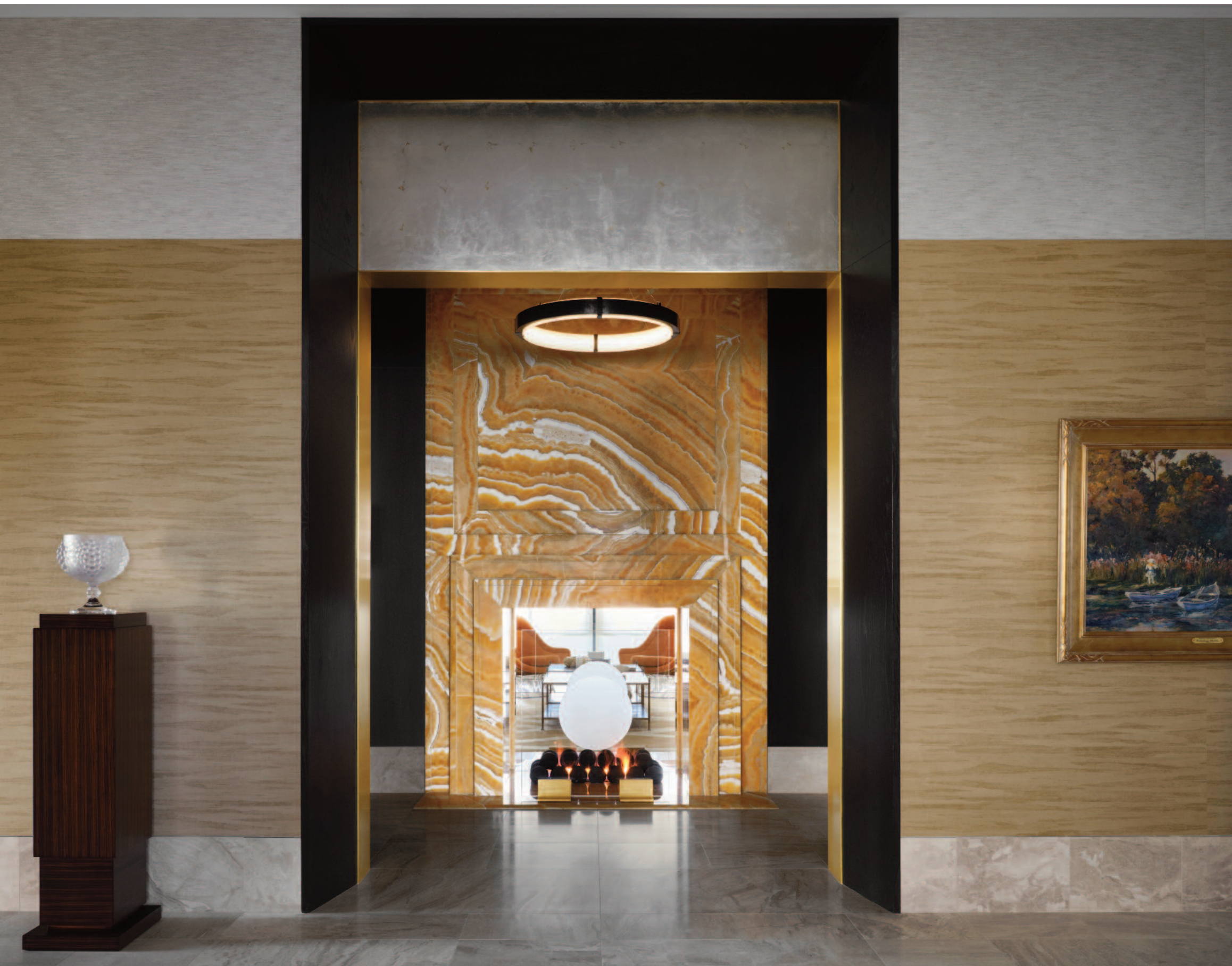
Left: The powder room vestibule is framed by a portal off the secondary crossing featuring a 12-foot-tall double-sided fireplace clad in orange onyx. Below: the entry gallery, which serves as the primary circulation, was created to feature the owner's large private collection of Hudson River School paintings.