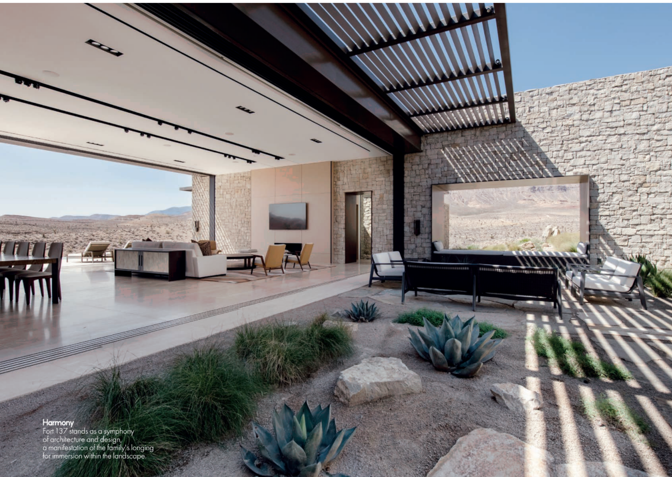
Harmony Fort 137 stands as a symphony of architecture and design, a manifestation of the family's longing for immersion within the landscape.