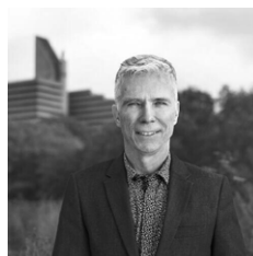
Claude Paquin Magazine FORMES Publisher